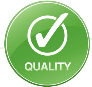
Guaranteed quality to the ISO22241 & ISO18611 standard