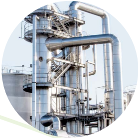
Largest AdBlue® production sites in the UK

Manufactured & supplied by Tennants, the UK's leading independent producer, Greenox® AdBlue® & AUS40 are supplied to you directly from a national network of distribution depots to give the best possible service, price & quality.