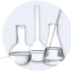
Every batch independently tested before release